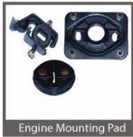
Engine Mounting Pad