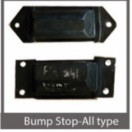
Bump Stop-All type