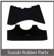
Suzuki Rubber Parts