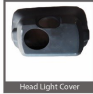
Head Light Cover