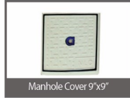
Manhole Cover 9"x9"