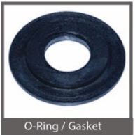
O-Ring / Gasket