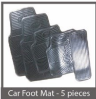
Car Foot Mat - 5 pieces