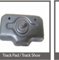
Track Pad / Track Shoe