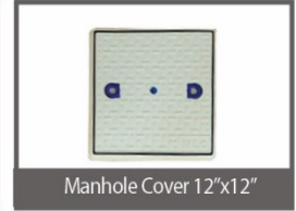
Manhole Cover 12"x12"