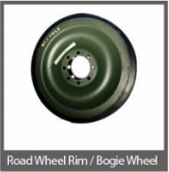
Road Wheel Rim / Bogie Wheel