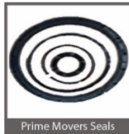
Prime Movers Seals