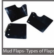
Mud Flaps- Types of Flaps