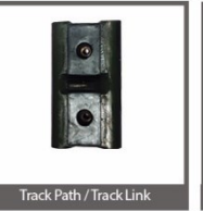
Track Path / TrackLink