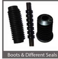
Boots & Different Seals